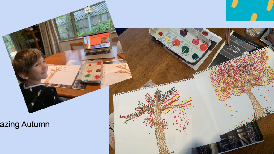
Some amazing Autumn artworks!!