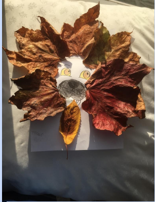
Sophia, Room 13