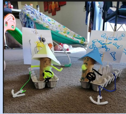
Reeve, Room 16