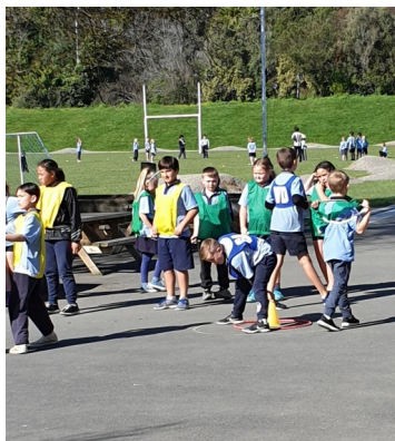
Chamberlain team took advantage of the sunshine on Friday afternoon and had an energetic game of Tapu wae.