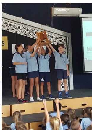
Well done to Tatahi for taking out the house cup at the end of last year!

Korari: a programme (workshop) that provides you with governance training to help you understand the role of school boards of trustees. We will be rolling out workshops for Korari in March/April this year. For more information, please visit www.nzsta.org.nz